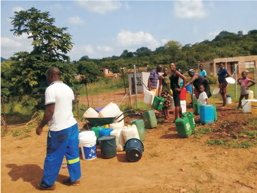
Residents of Sasekani village fetching water from the communal taps