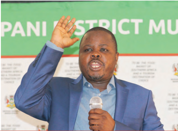
Executive Mayor Pule Shayi addressing hundreds of young people at then Youth Month Commemoration rally at Matswi village.