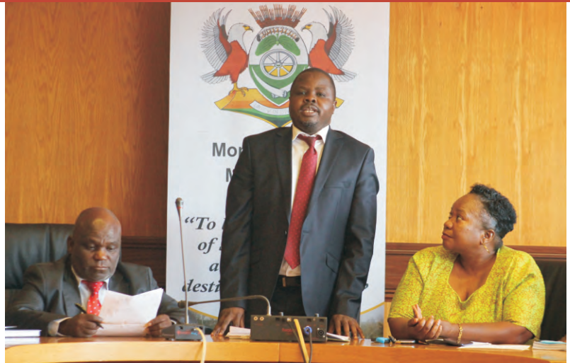
• The new Executive Mayor Cllr Pule Shayi addressing employees during a meet and greet session.

The staff members cheered in acknowledging and accepting the welcome address by the Executive Mayor Cllr Shayi. The Executive Mayor Shayi also urged all employees to go and extra mile in serving the people of Mopani District Municipality. The Municipal Manager, Directors and managers also attended the session. Municipal Manager Republic Monakedi says the employees are delighted to have someone of Shayi's calibre leading the institution.