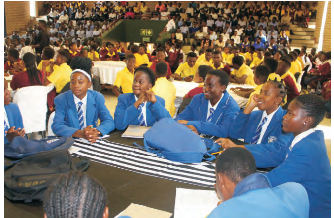
Learners from across the district at the Children's Parliament at Lulekani.