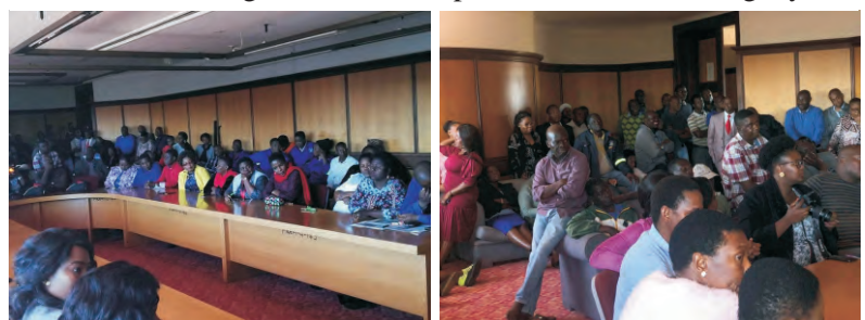
Employees attentively listening to the Executive Mayor during the meet and greet session