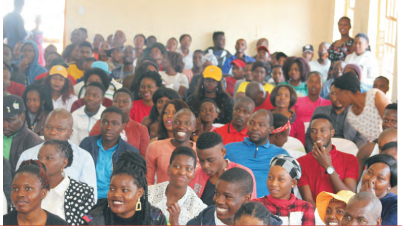
Young people attending the Youth Month rally