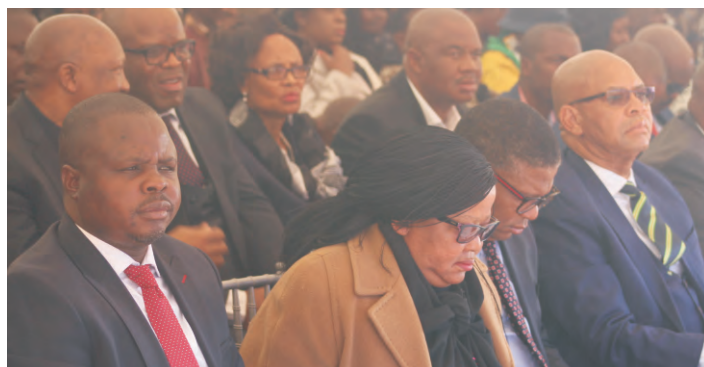
Dignitaries at the Maphalle 24 funeral

The Mopani District Municipality under the leadership of the Executive Mayor Councillor Pule Shayi has assisted in the burial of 24 young people who perished in a horrific accident that happened on the 81 Mooketsi-Giyani road. The victims died in a head-on collision between a bus and a mini bus on the 16 of June 2019. The Executive Mayor Pule Shayi immediately established a Preparatory Committee which was tasked with a responsibility to organise a memorial service and a mass funeral service. Transport Minister Fikile Mbalula, his provincial counterpart Dickson Masemola, Premier Stan Mathabatha, Deputy Minister Dikeledi Magadzi, Health MEC Phophi Ramathuba, her Social Development counterpart Nkakareng Rakgoale and the Greater Letaba Municipality Mayor Peter Matlou were among thousands of mourners who paid their last respects a mass funeral service held at Ga-Rapitsi near Kgapanne. Minister Mbalula urged road users to always obey traffic rules in order to clamp down on road carnage.