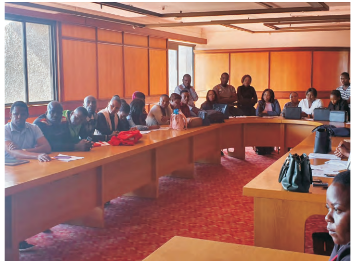
The interns being welcomed in the Mopani District Municipality.