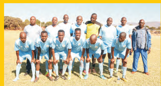
Mopani District Municipality football team ahead on their match with Molemolle at the IMSSA games held at the Hoerskool Pit Potgieter in Mokopane.