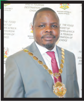
Cllr Pule Shayi Executive Mayor