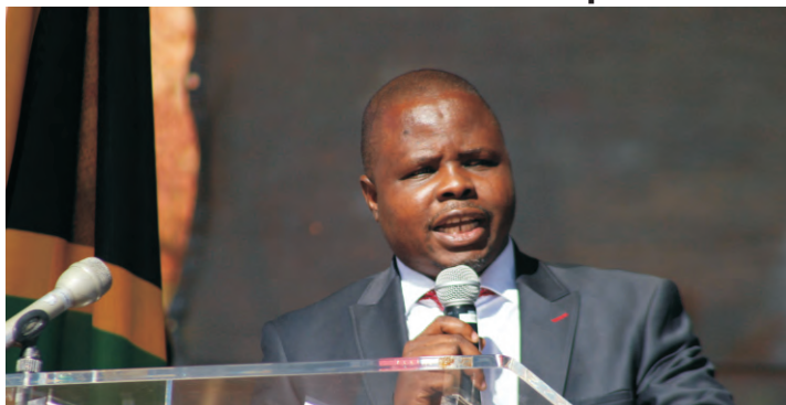
Executive Mayor Councillor Pule Shayi giving vote of thanks at Rapitsi's Sport Ground